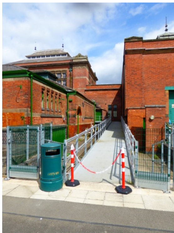
Museum gallery emergency exit & external ramp.