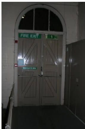
Internal Gallery emergency exit.