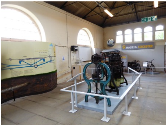
Part of of the Main Gallery