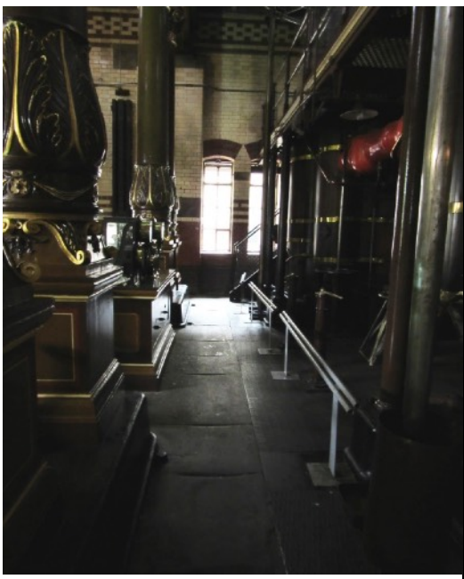
Route to Switch Room /Café