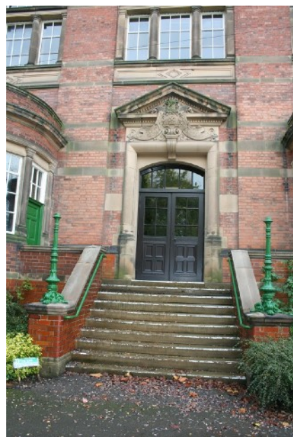
Emergency Beam Engine House exit