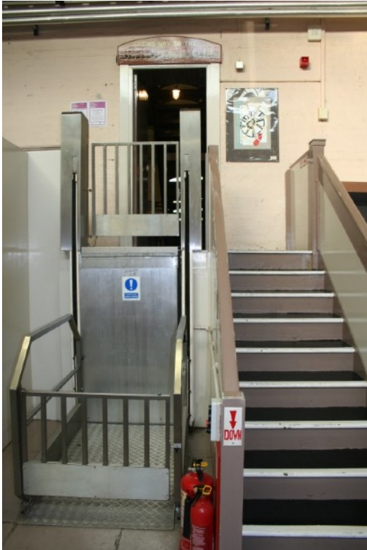
Platform lift and stairway to beam engine floor